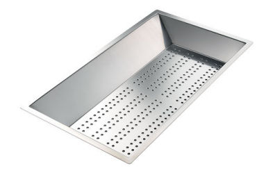
Stainless steel perforated tray