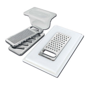
Graters kit with ring-holder and food collection tray