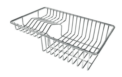
Stainless steel plate rack